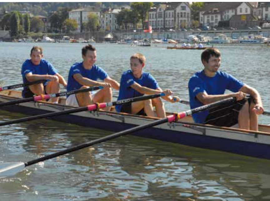
Family in Heidelberg: Adaptable, important, family friendly.

Teenagers – There are meeting points in the different quarters open to all teenagers. In addition, there are a variety of youth associations overseen by the municipal youth department.